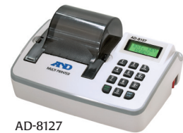
AD-8127 Compact Printer